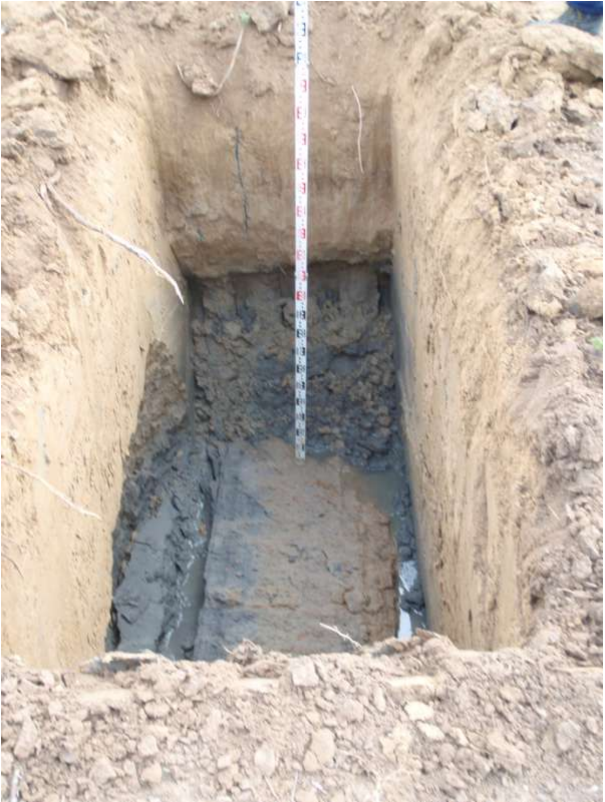
Plate 5. Geotechnical test pit (TP. 2)