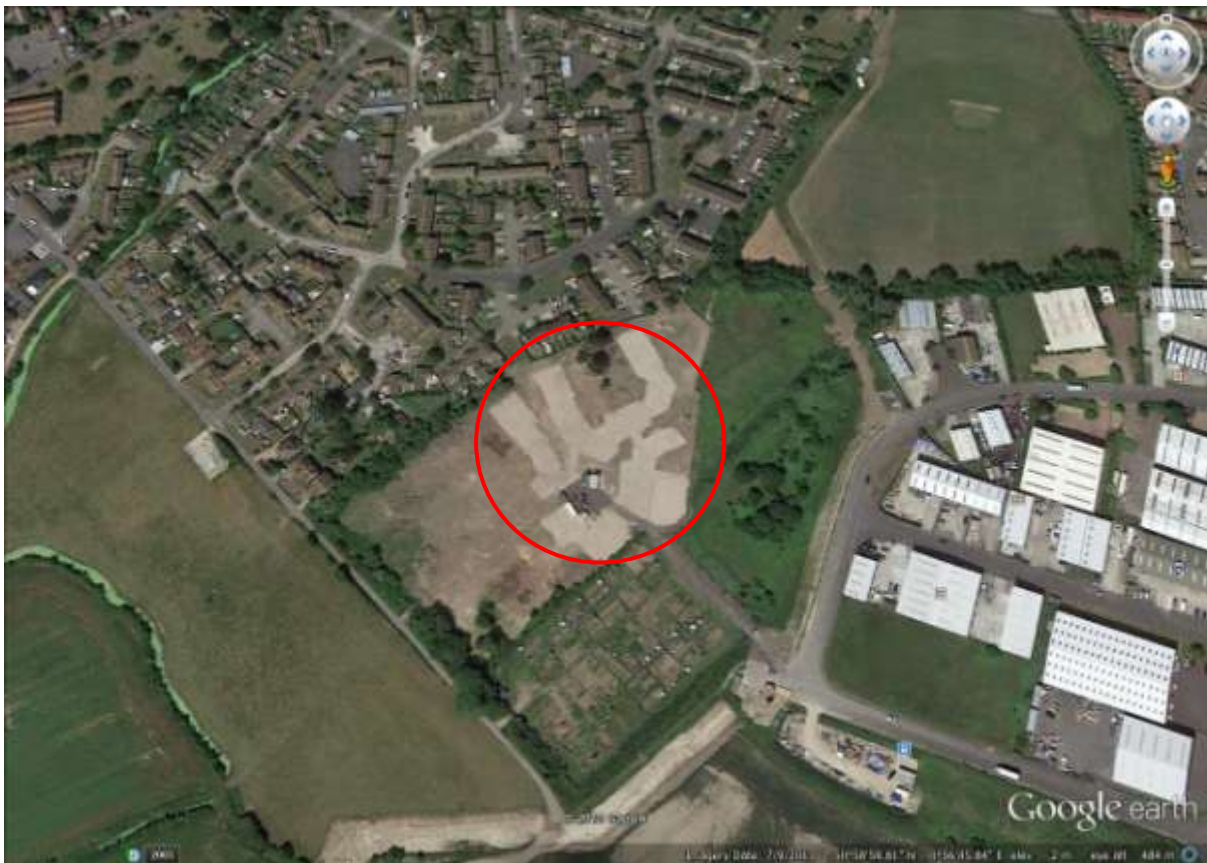
Plate 1. Aerial view of site (red circle) showing the site prior to development.