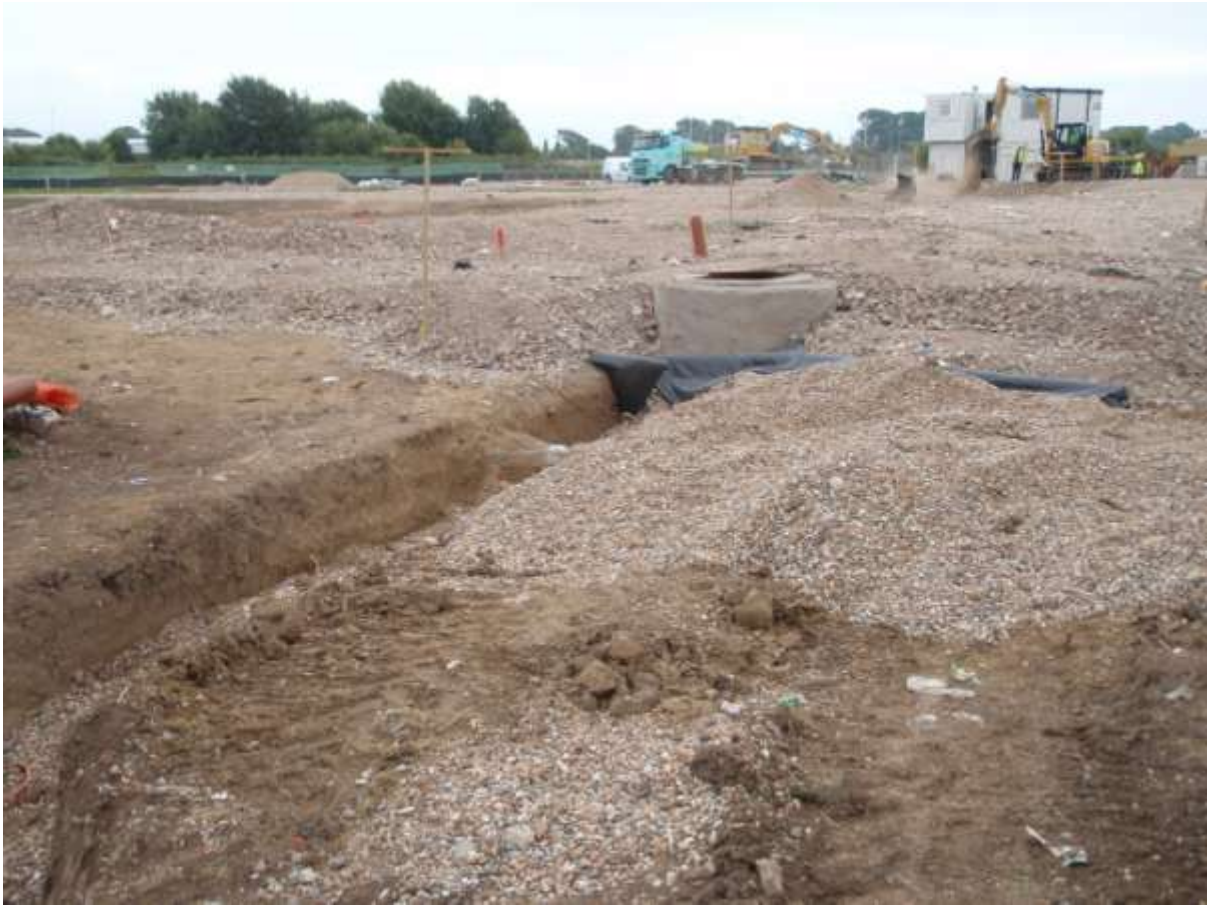
Plate 2. General view of the site showing build up of site under progress, facing south-west