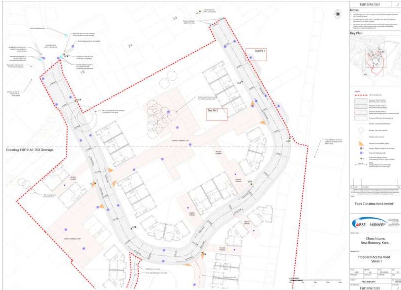
Figure 1: Location of Test Pits 1 and 2 at Church Lane, New Romney, Kent (NGR: TR 066 245).