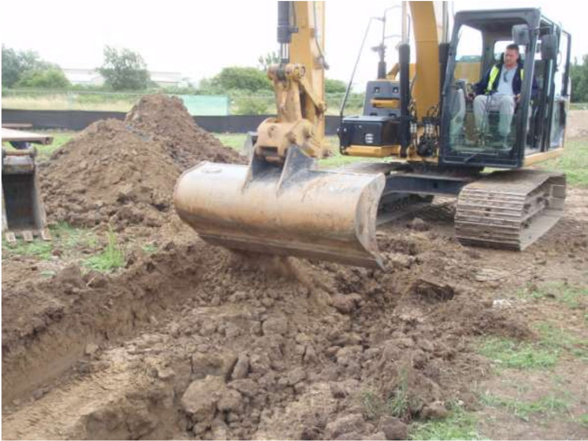
Plate 3. The site showing the excavation of drainage runs (facing south)