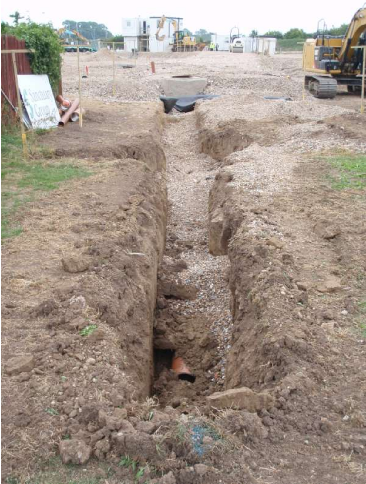
Plate 4. Drainage trenches and in background hardcore build up over the entire site (facing south-east)