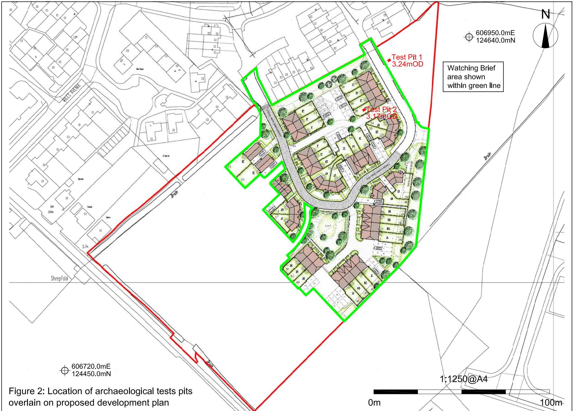
Figure 2: Location of archaeological tests pits overlain on proposed development plan